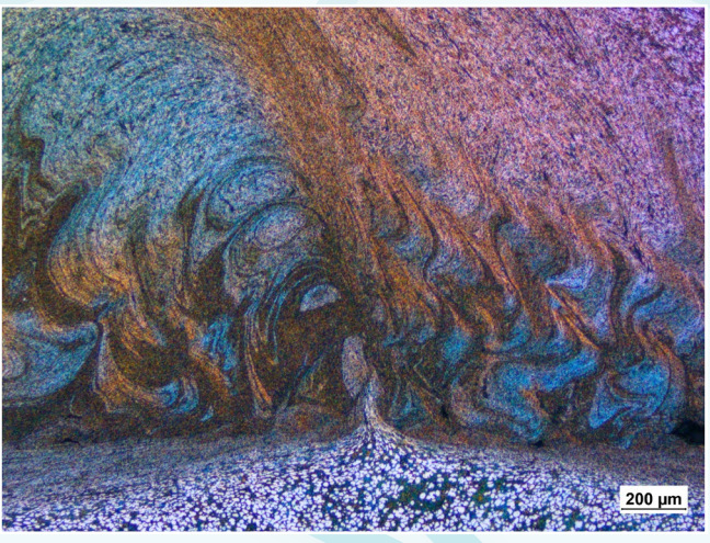
Aluminium friction stir weld, etched according to Barker, POL + Lambda Compensator, 50x